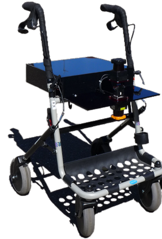
Fig. 1. The smart walker, a modular system composed of a standalone processing unit and an off-the-shelf walker. The processing unit includes two laser scanners and the required computing capabilities. The lower laser scanner is fixed and used for egomotion estimation. A servo motor tilts the upper scanner continuously up and down to acquire a three-dimensional representation of the environment.

Our system consists of a standard off-the-shelf walker, retrofitted with sensors and data-processing capabilities. The sensing and processing unit is built in a modular fashion, such that it can be easily mounted on different walker brands. The system additionally includes a vibration belt comprising five vibrating motors, which provide haptic feedback to the user. An image of the smart walker is shown in Figure 1, while Figure 2 depicts the vibration belt.