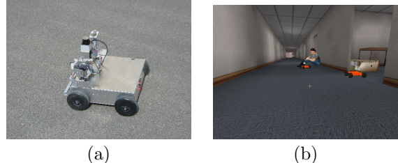
Fig. 1. The rescue robot Zerg (a) and the corresponding model (b) within the USARSim simulation.

The test platform utilized for experiments presented in this paper is based on a realistic model of the differentially steered Zerg robot, as depicted in Figure 1(a). The robot is equipped with a Hokuyo URG-X003 Laser Range Finder (LRF), and an Inertial Measurement Unit (IMU) from XSense providing measurements of the robot's orientation by the three Euler angles yaw , roll , and pitch . The