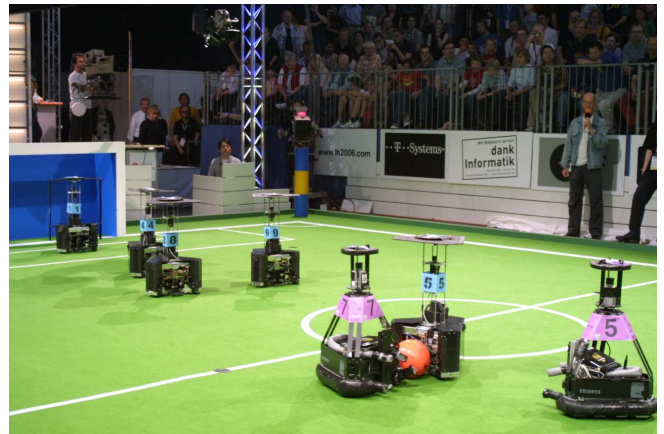
Figure 1: Picture from the 2006 finals in the RoboCup MiddleSizeLeague between the teams Brainstormers Tribots (magenta) and CoPS (blue).

With the team Brainstormers Tribots we participated in the MiddleSizeLeague for six years between 2003 and 2008 which gives us the possibility to pass in review the development of the RoboCup MiddleSizeLeague competition and to discuss its scientific impact and its benefits. Due to the topic of this paper some arguments presented throughout the text are personal assessments. The paper aims at describing our experiments and helping researchers interested in participating in competitive scientific events to assess the risks and possible rewards. Since we want to focus on the relationship between competitive scientific events and research we will not discuss the impact of robot soccer on education, pub-