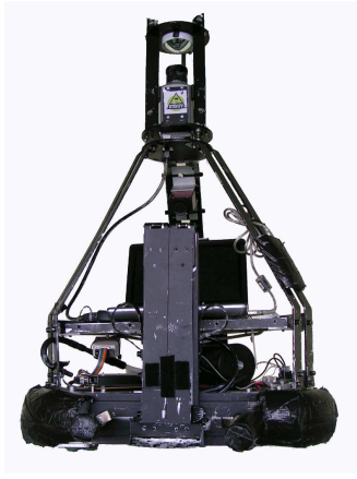
Figure 2: Robot of the team Brainstormers Tribots in the year 2007. From top to bottom the picture shows the omnidirectional camera, an additional perspective camera, the control laptop, the kicking device, and the chassis.