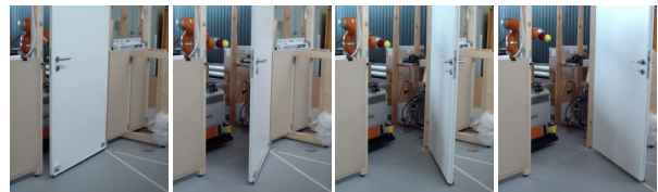
(a) Being able to predict the dynamic behavior of the door, the robot can swing it open precisely to a desired state, here 60^\circ . The manipulation time from touch to release of the door is approximately one second.

This work has partly been supported by the European Commission under the contract number FP7-ICT-248258-First-MM, the National Science Foundation under grant CCF-1208468, FRIAS, University of Freiburg and the DARPA under W15P7T-12-1-0002